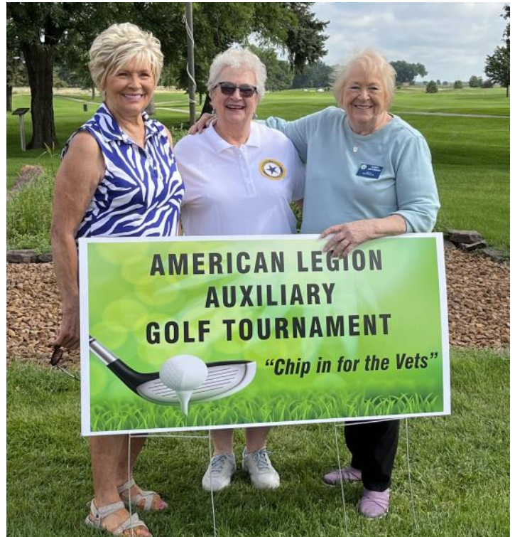
Unit 15's first annual golf tournament, August 16.